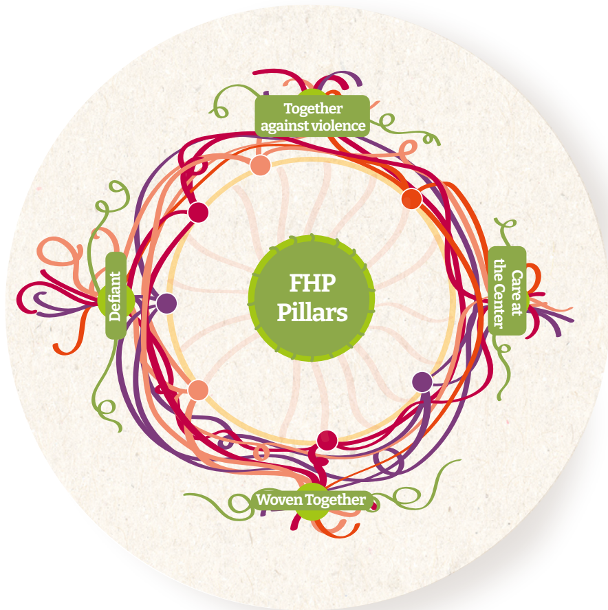
Artwork: Consuelo Mora B

It is a political vision and practice based on four main pillars: